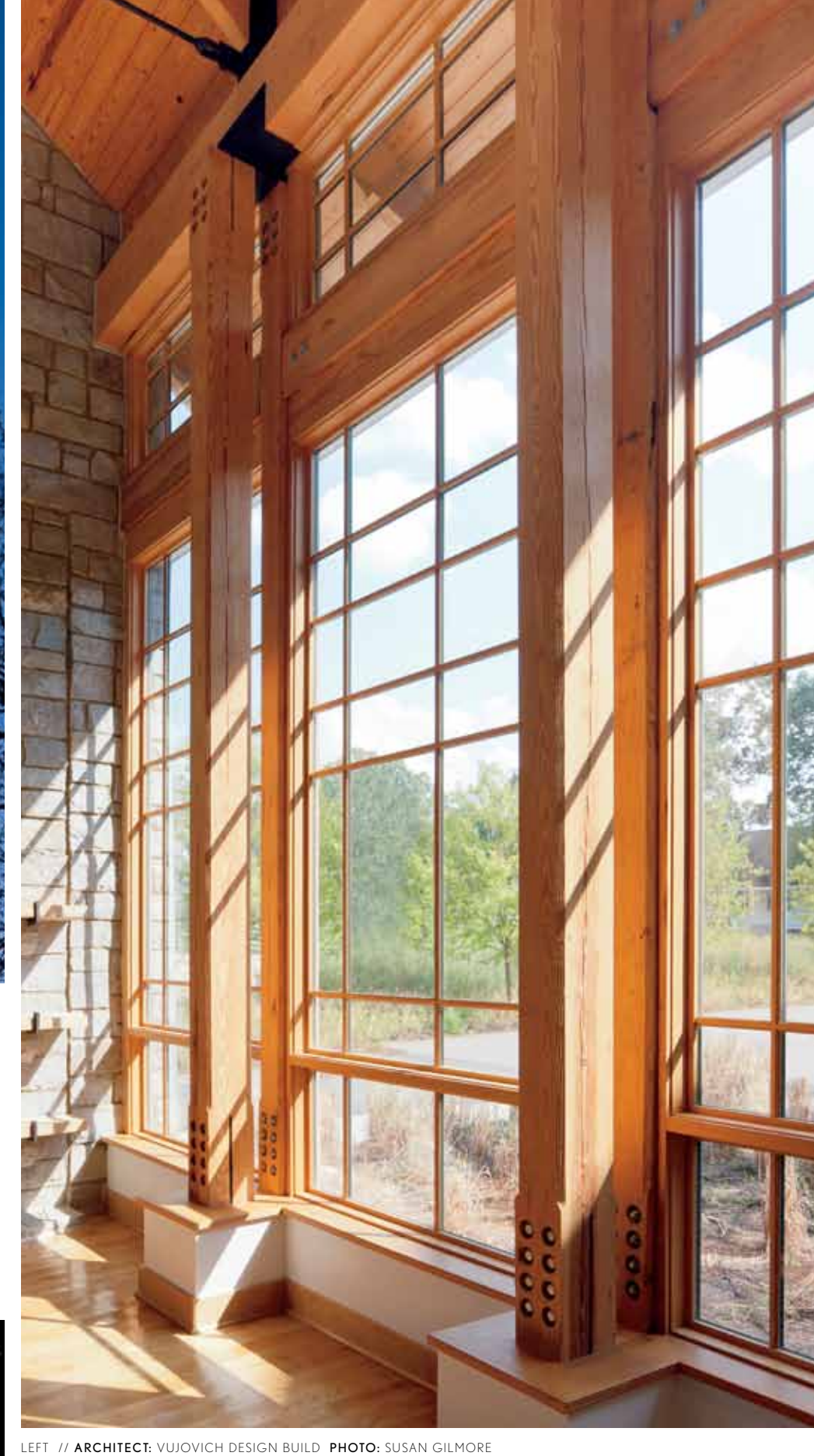
LEFT // ARCHITECT: VUJOVICH DESIGN BUILD ABOVE // ARCHITECT: COOPER CARRY